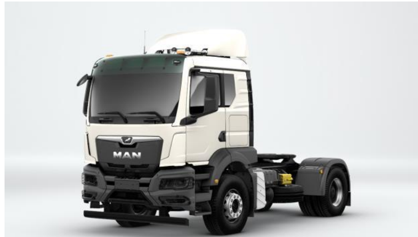
Illustration can deviate